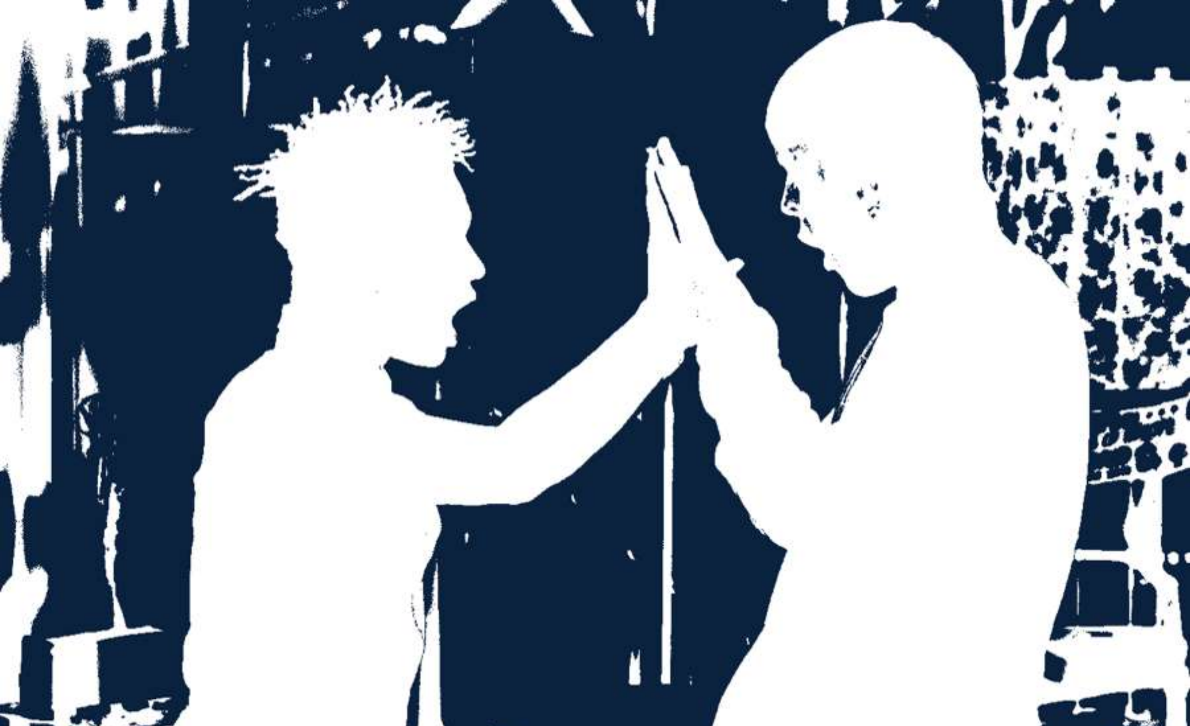
A production image from Collective Encounters Youth Theatre show The Streets Where the Stories Live , planned to be revived for festivals nationally for Summer 2020 and now unlikely to be remounted